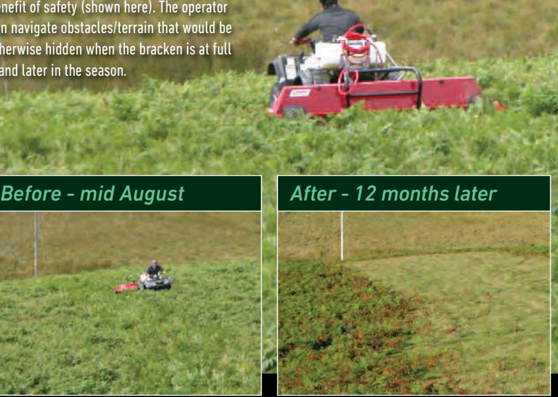
Glyphosate applied at a dilution rate of 20 : 1 with a work rate of up to 7 acres (2.8Ha) per hour using this 2.5 metre wide model. Work rate dependent on forward speed, terrain and ground conditions.

Bracken can be treated early with glyphosate during vigorous growth with the benefit of safety (shown here). The operator can navigate obstacles/terrain that would be otherwise hidden when the bracken is at full stand later in the season.