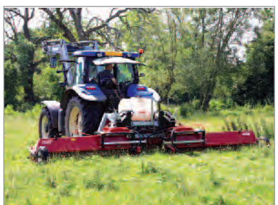
CTM600W 'Grassland' model with 6.0 metre working width seen here wiping nettles and thistles in permanent pasture. This model of weed wiper was used to apply Glyphosate to the field (left) with an infestation of rush. The result is amazing and has transformed the grazing potential of the field.

15 months later this is the scene. The removal of rush and coarse grass has allowed finer grasses to re-establish and flourish to provide good grazing for years to come.