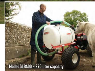
Model SLB400 - 270 litre capacity

This 600 litre Bowser (left) is fitted with a manege watering kit, powered by a Honda pump. This unit provides an essential function of 'damping down' arenas for dust suppression. It can also be used as a general purpose bowser for anywhere that needs a lot of water in a hurry!