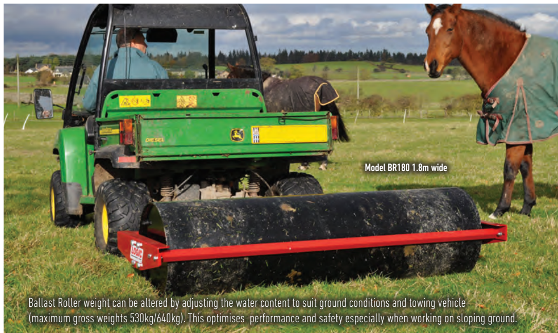
Model BR180 1.8m wide

Ballast Roller weight can be altered by adjusting the water content to suit ground conditions and towing vehicle (maximum gross weights 530kg/640kg). This optimises performance and safety especially when working on sloping ground.