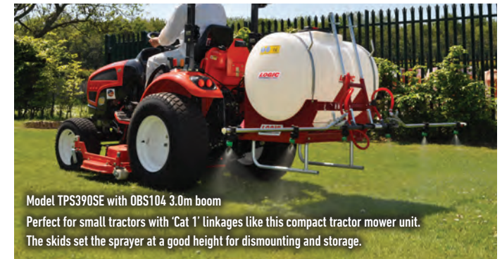
Model TPS390SE with OBS104 3.0m boom Perfect for small tractors with 'Cat 1' linkages like this compact tractor mower unit. The skids set the sprayer at a good height for dismantling and storage.