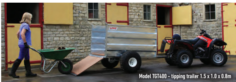
Model TGT400 - tipping trailer 1.5 x 1.0 x 0.8m

Trailers are a simple but important tool for any busy equestrian. The amount of time and hard work saved with the use of a suitable trailer can be tremendous. Logic has a range of models to cover most requirements and sizes to go behind any suitable vehicle with a 50mm tow ball.