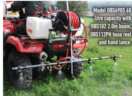
Model OBS690S 60 litre capacity with OBS102 2.0m boom, OBS112PH hose reel and hand lance.

There is a wide model range powered by the host vehicle's 12v electrical system, with capacities, hand lances and booms to suit every situation. Contact a Logic dealer or one of our offices for more advice.