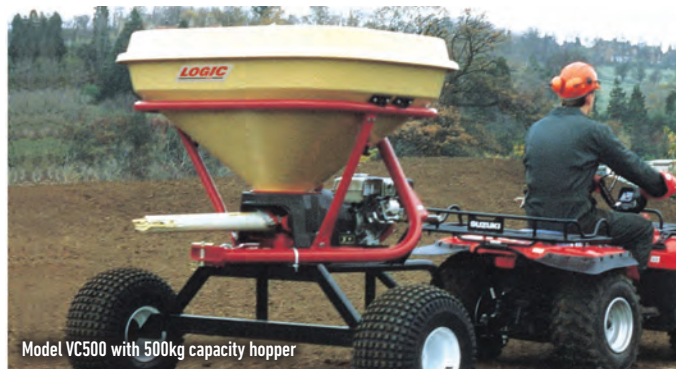
Model VC500 with 500kg capacity hopper

Engine Driven Spreaders are designed for soft ground or when no tractor is available. The hopper can be filled to suit the towing vehicle.