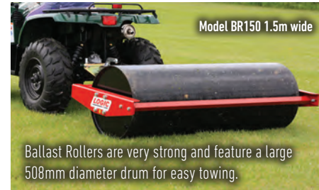
Model BR150 1.5m wide

Ballast Rollers are perfect for levelling soft ground or for use after reseeding worn areas.