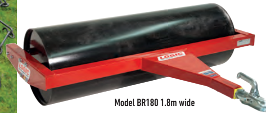
Model BR180 1.8m wide

Ballast Rollers are very strong and feature a large 508mm diameter drum for easy towing.