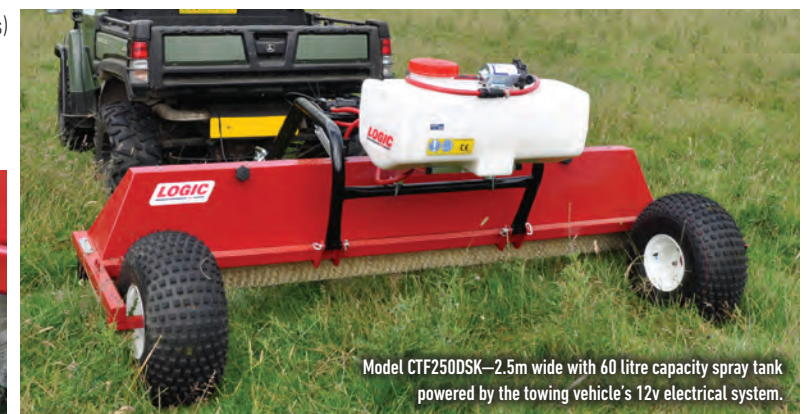
Model CTF250DSK—2.5m wide with 60 litre capacity spray tank powered by the towing vehicle's 12v electrical system.