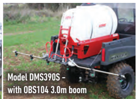
Model DMS390S - with OBS104 3.0m boom

Deck mounted sprayers are easy to mount into a UTV to provide a large 270 litre capacity, with in cab controls.