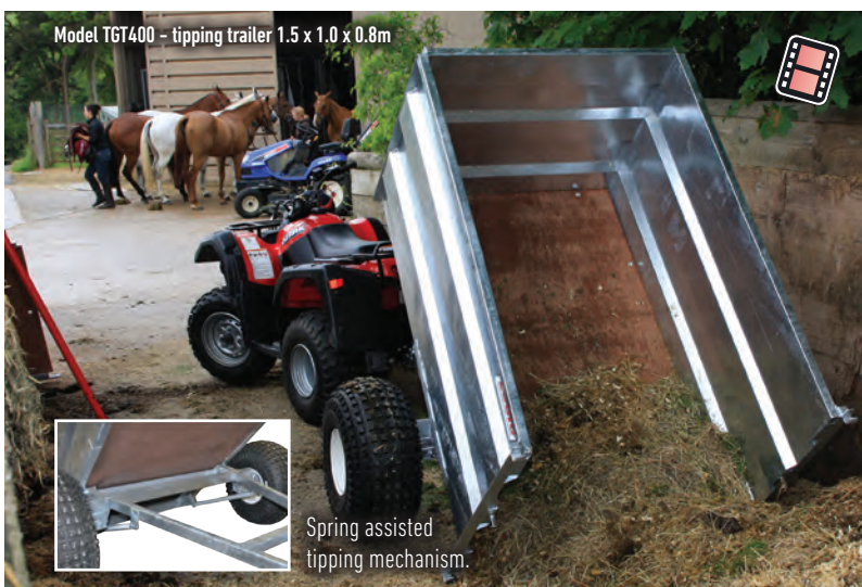
Model TGT400 - tipping trailer 1.5 x 1.0 x 0.8m