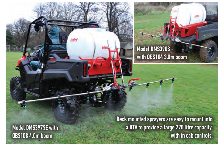
Model DMS397SE with OBS108 4.0m boom

Deck mounted sprayers are easy to mount into a UTV to provide a large 270 litre capacity, with in cab controls.