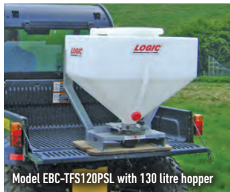
Model EBC-TFS120PSL with 130 litre hopper