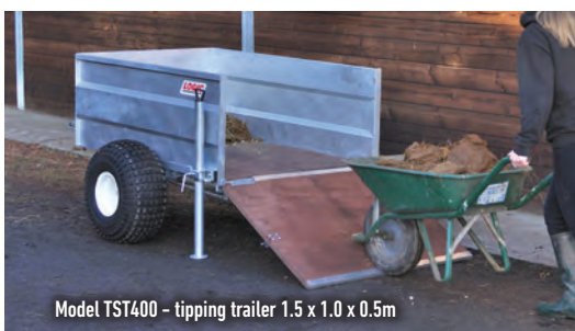
Model TST400 - tipping trailer 1.5 x 1.0 x 0.5m

Logic tipping trailers are tapered to ensure the load empties easily. The tailgate doubles as a loading ramp for wheelbarrows, etc. and the body is spring loaded to help tipping. The model (left) has optional prop stands and jockey wheel fitted.