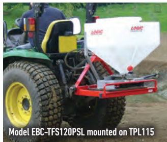
Model EBC-TFS120PSL mounted on TPL115

Engine Driven Spreaders are designed for soft ground or when no tractor is available. The hopper can be filled to suit the towing vehicle.