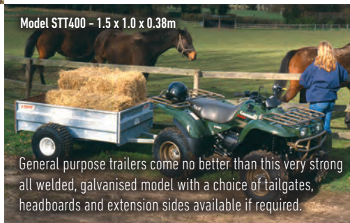
Model STT400 - 1.5 x 1.0 x 0.38m

Using the this trailer to transport bales to a field is a one-person job and takes minimum effort thanks to the unique double pivot system, manual winch and sturdy straps.