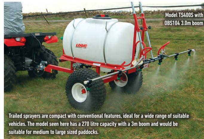
Model TS400S with OBS104 3.0m boom

Trailed sprayers are compact with conventional features, ideal for a wide range of suitable vehicles. The model seen here has a 270 litre capacity with a 3m boom and would be suitable for medium to large sized paddocks.